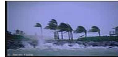
Trees can be a hazard to water lines during a storm.

≈ A tropical storm in the 90's dramatically demonstrated the need for proper coordination of tree plantings. It took 2 days to restore full water service to an entire neighborhood after the trees blew over & took electrical lines with them. During the hurricanes of 2004, trees took down electrical lines and pulled up water lines, thus leaving parts of the Seacoast service area without electric and/or water for over a week at a time. Fixing a water main was the easy part, sawing the roots of the toppled trees away from the mains took many, many hours.